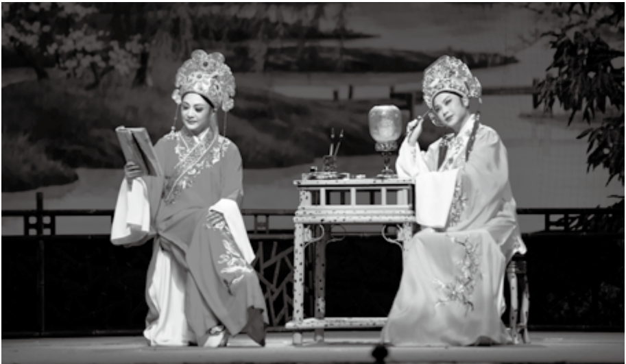
■ Stage photo of Yueju The Butterfly Lovers

Having entered Shanghai, Yueju continued to learn from others, in order to survive in the competitive performance market. The focus of its repertoire gradually changed from short drama of rural life to long drama of ancient costume, and its singing and accompaniment music have been both enriched and developed. In the Shanghai of 1920s, actresses on stage were in vogue. The actors of Xiaogeban, who were all males, inspired by this phenomenon, set up the first all-female troupe in 1923. Yueju thus began the transformation from all-male troupes to all-female troupes.