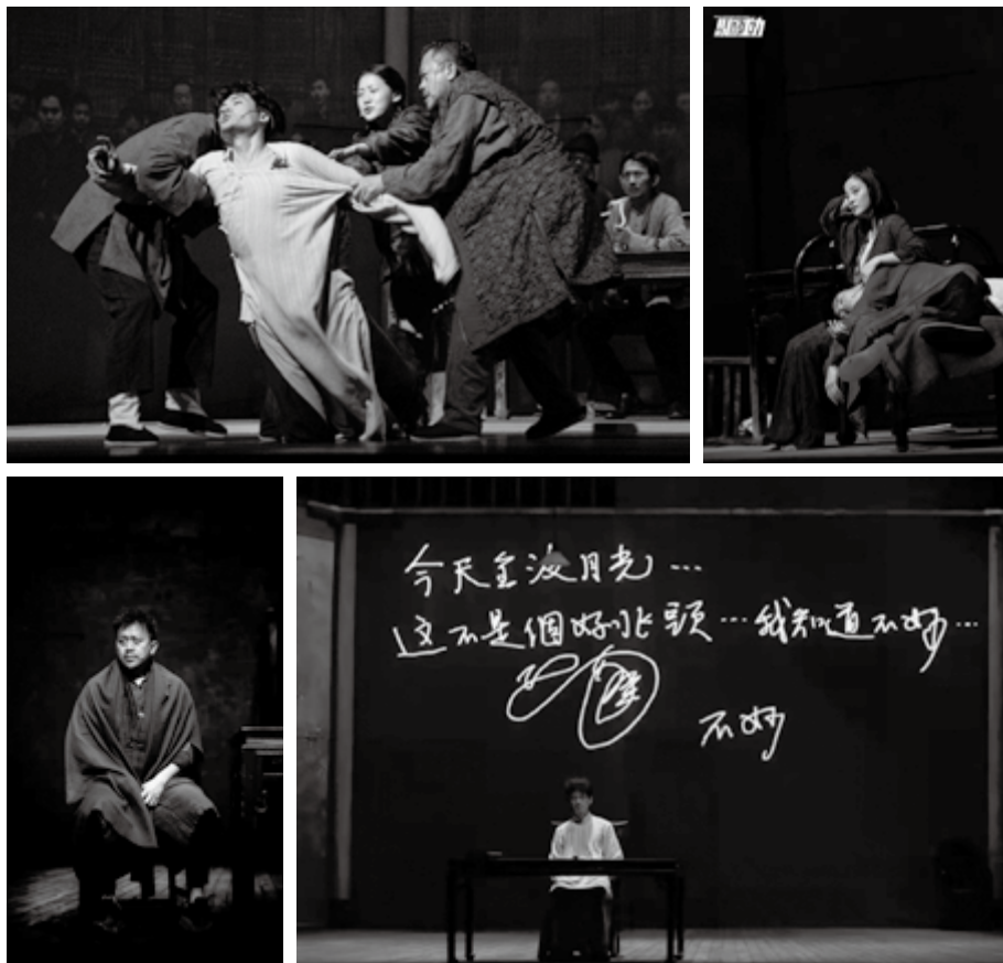
■ Stage Photo of Diary of a Madman

told the actors that in order to show the evil side of the role, they should not only play the “evil” side of the role superficially, but portray the hidden evil and hide it well at the same time, so as to perform a real “villain”. In this way, the characters in Lu Xun’s works can become fuller and truer to life.