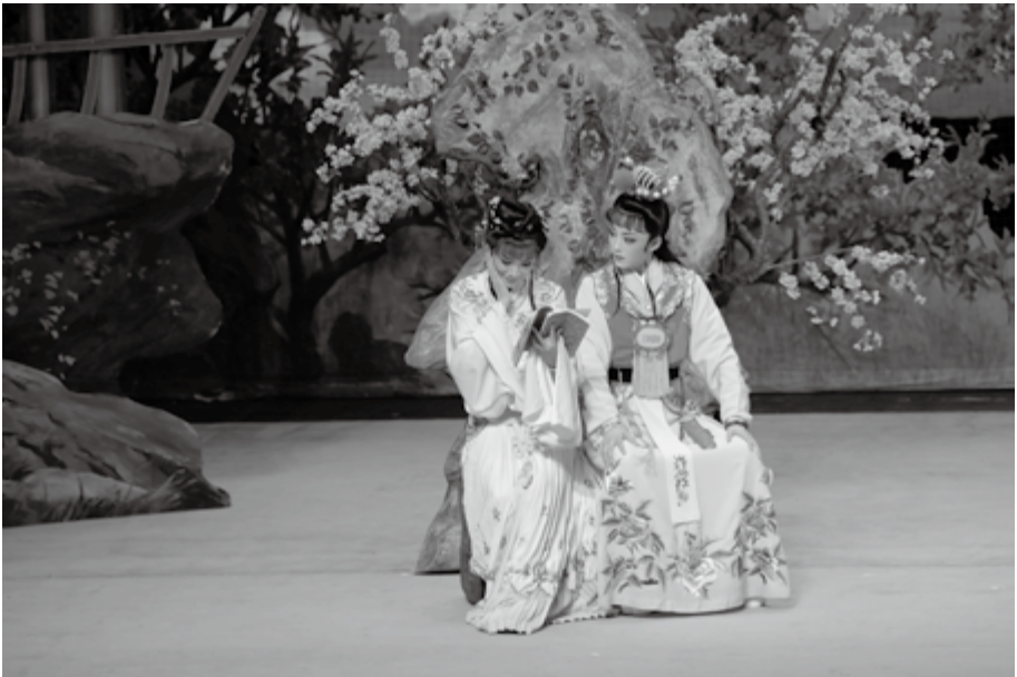
■ Stage photo of Yueju The Dream of Red Mansion