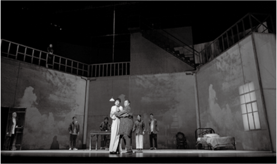
■ Stage Photo of Diary of a Madman

can avoid a sociological abstract interpretation of the historical reality.