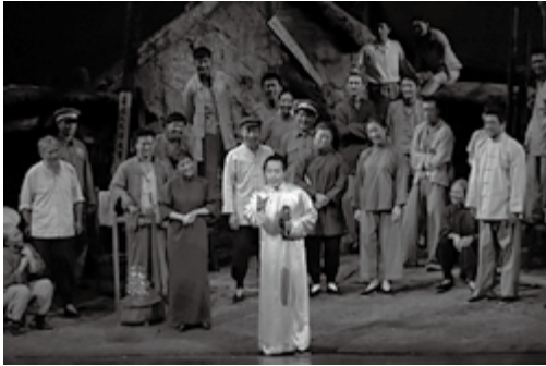
■ Stage photo of The Dragon Beard Ditch on the stage of the Beijing People's Art Theater, 2009

injury in old age, went to Dragon Beard Ditch to talk with the local people. Within a month, Lao She finished writing the first draft of Dragon Beard Ditch . It was published in the journal "Beijing Arts" in September.