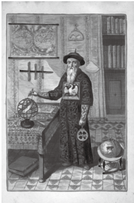
■ The portrait of Johann Adam Schall von Bell

1661), and Joseph de Premare (1666-1736), to whom we were familiar with. They were of great significance to the spreading of “the Chinese culture to the west” and “the Western culture to China”. The latter undertook the function of educating the people. Especially in the aspect of winning over and attracting the ever-lost believers in the German speaking area, the Jesuits, with the help of drama, took Latin as the official language of the Jesuits drama performances, and tried to implement its plan of popularizing Latin by performing drama in it. At the same time, with the help of drama, a lively and interesting classroom, instead of boring moral preaching, the German people were educated and the stage became an artistic