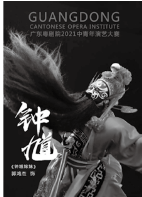
■ Stage photo of Zhong Kui Marries off His Sister

The Emerald Hairpin is a new version created by Zhejiang Xiaobaihua Yueju Troupe in 2018, all performed by young actors. This love story of the Ming Dynasty has been widely circulated and written into many types of theatre, among which the Yueju version was the most classic. Gentleman in flowers was also a classic rehearsal repertoire. It was a modern presentation in the spirit of free performances and emotional expression based on the 1983 version performed by Lv Ruiying, the famous master of the Lv School of Yueju. Adapted from Lu Xun’s novel Blessing , Xianglin Sao was starred by Yuan Xuefen in 1946 and hailed as a milestone in the reform of Yueju in the 1940s. The script embodied the spirit of Lu Xun’s original work and successfully shaped the typical artistic image of Xianglin Sao. The 2021 version was starred by three generations of actors from the young, mid-aged to the old on the