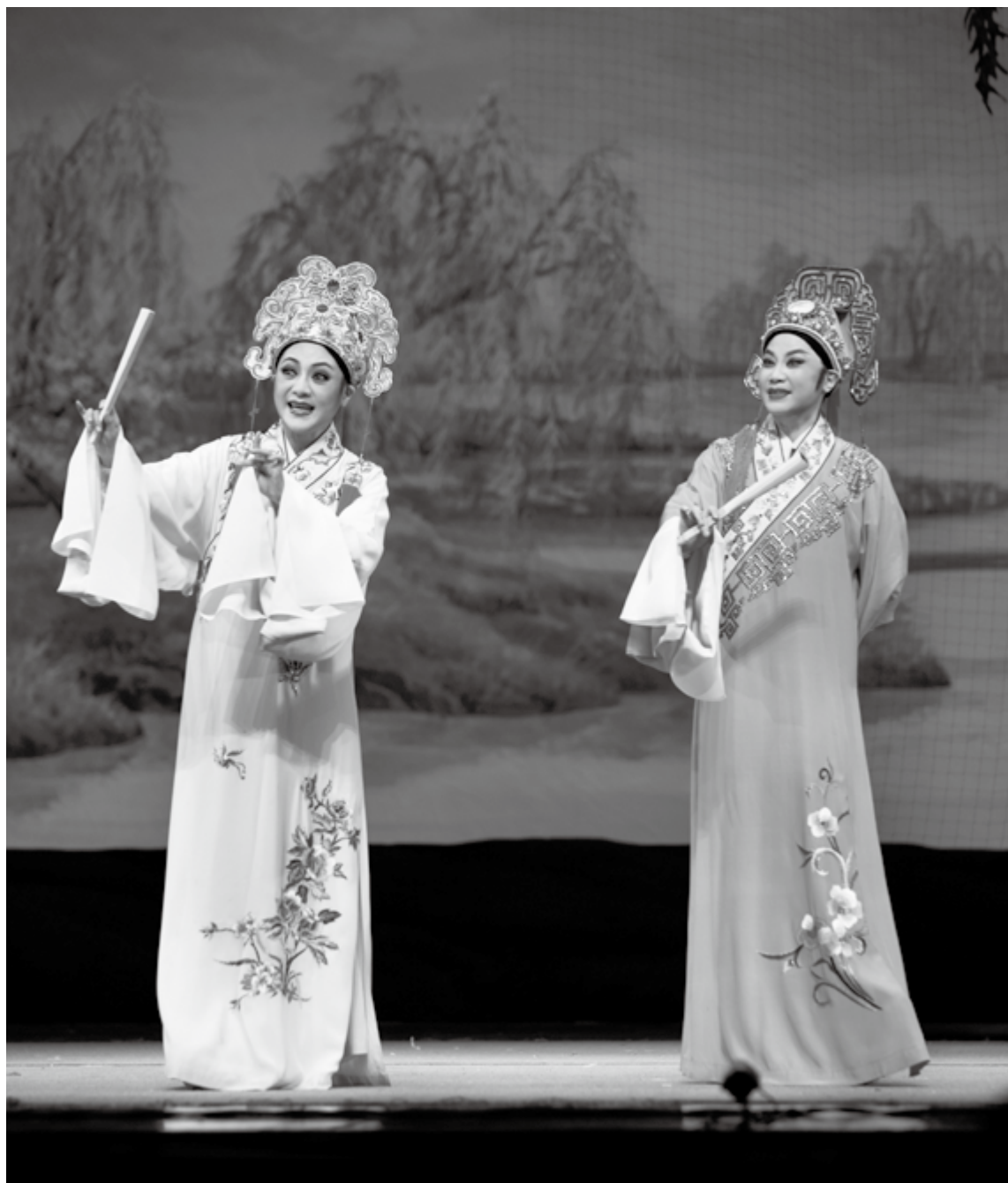
■ Stage photo of Yueju The Butterfly Lovers