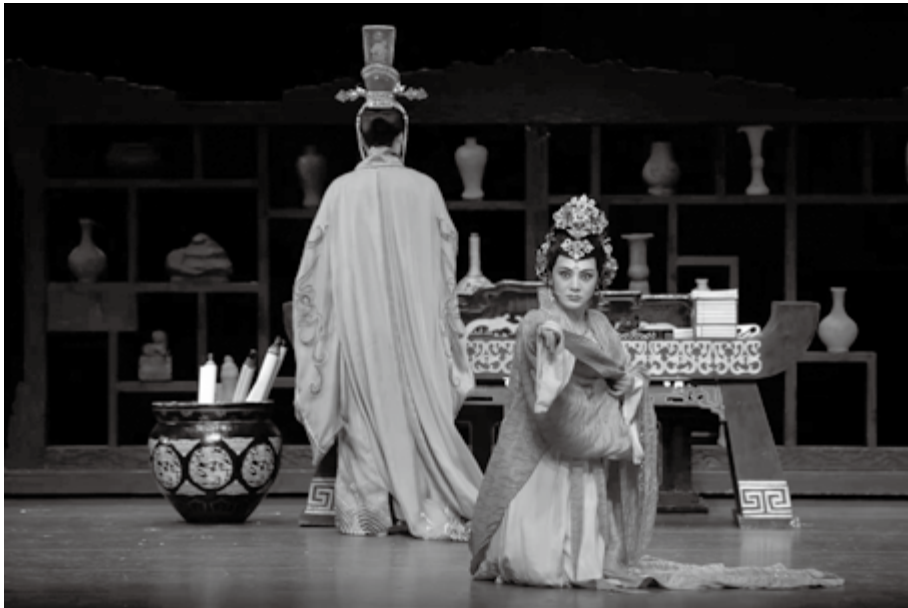
■ Stage photo of Yueju The Legend of Zhen Huan

and their performances accord better with the female audience in aesthetic taste, which consolidated the characteristics of Yueju: considering women's point of view and regarding female audiences as their main consumers.