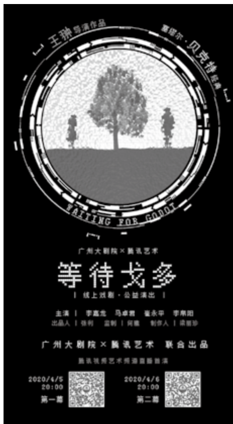
■ Online performance poster for Waiting For Godot

Jinghui gave it its global debut at the Aranya Drama Festival, and it was presented again at the Suzhou Bay theatre Festival in August. On the basis of the original novel, the play The Ballad of the Sad Cafe incorporated the spiritual elements of writers such as Hemingway and Faulkner to tell the story of a secretive and absurd love affair between three lonely people. Meng Jinghui staged it in China's largest seaside Amphitheatre, with the nearby library as the backdrop and sea breeze and sunsets as the setting, thus creating an immersive visual and auditory experience for the audience.