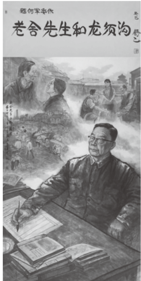
■ The portrait of Lao She

The success of Dragon Beard Ditch was also thanks to the contribution of the director Jiao Juyin and the leading actor Yu Shizhi. As the leading director of Beijing People's Art Theatre, director Jiao Juyin made some adaptations after