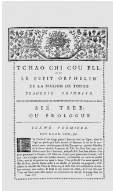
■ French version of The Orphan of Zhao translated by Joseph de Prémare in the 18 th century