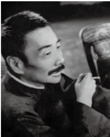
■ The photo of Lu Xun