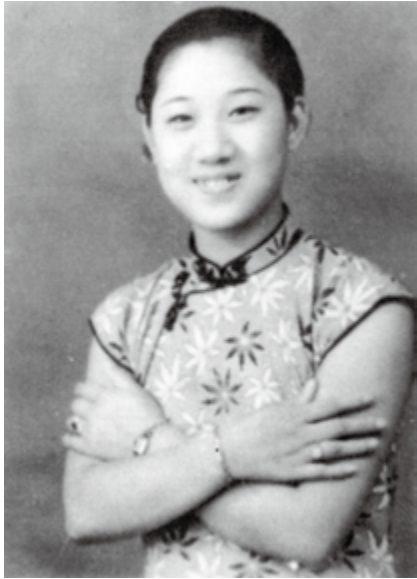
■ The Actress, Female Xiaosheng Ma Zhanghua

first generation of girls with natural, unbound, feet after the fall of the Qing Dynasty, but also because the primary motivation of them, and many other poor rural girls after them, to participate in Yueju was to avoid the fate of becoming a child bride.