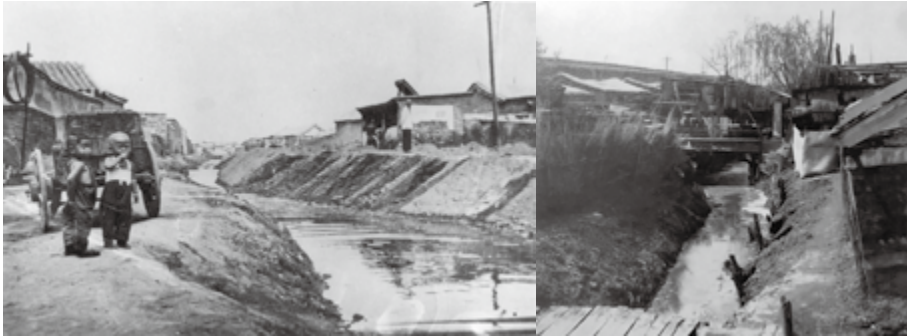
■ The old scene of the Dragon Beard Ditch

getting the draft, using his expertise to make it more of a stage spectacle. He also took the actors to Dragon Beard Ditch. By living there, the actors got to feel what their characters felt. Yu Shizhi, the actor who played “Crazy Cheng” gained the most from the experience.