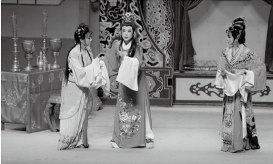
■ Stage photo of Yueju The Dream of Red Mansion

and the environment. This strong contrast was reflected here for the first time, which was also an important stroke for their romantic tragedy. This detail was kept for the 1957 revision, and not deleted until 1958.