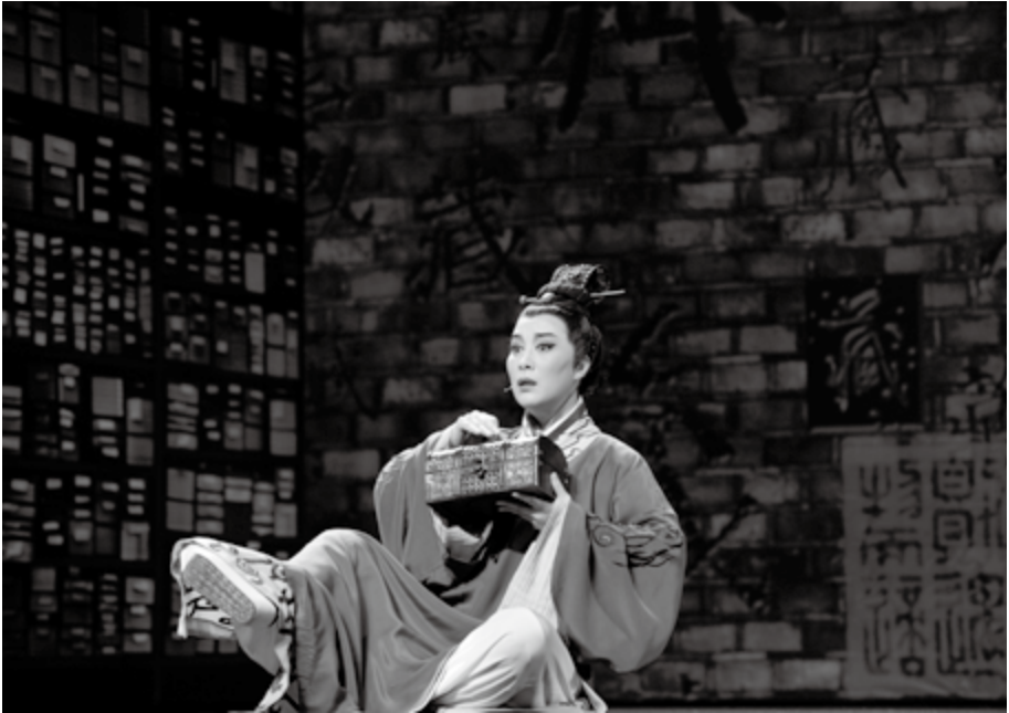
■ Fan Rong, portrayed by Mao Weitao in Yueju A Family of Book Collectors

audience accepted it better than expected. This is an improvement based on the successful singing of the Female Xiaosheng in Yueju . I have been hoping to build on this and spread this form of singing further, to new audiences.