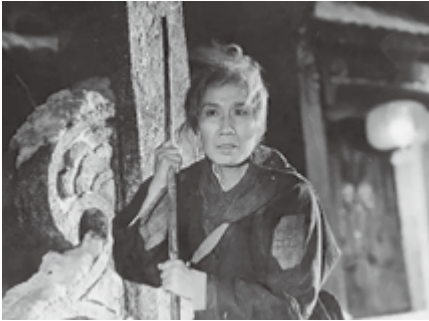
■ Stage Photo of Xianglin Sao ; Yuan Xuefen as Xianglin Sao

feeling sympathetic about her peers' degrade themselves, she kept her self-respect since she became a minor celebrity. She declined all the banquets on the pretext of being vegetarian. She also declined invitations to perform outside the theater, such as hall performances. She insisted on keeping her respect for the sacred stage and the dignity of being an artist, and thus kept her backstage closed to any type of visitors.