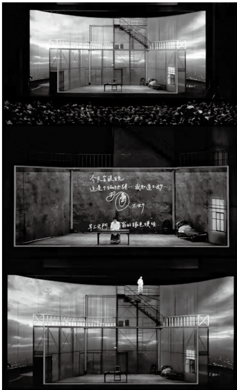
■ Stage Photo of Diary of a Madman