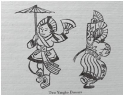
■ Yangko dancers 2