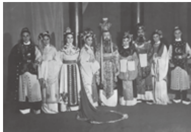
■ "Ten Sisters" of Yueju on stage