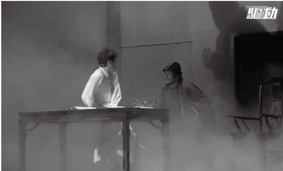
■ Stage photo of Diary of a Madman

narrator can better illustrate his intention of dismantling Classical Realism. At the beginning of the novel Diary of a Madman , there was a rational narrator who objectively and dispassionately recounted the fact of obtaining the diary. This was not necessarily Lu Xun himself, but it had Lu Xun's strong autobiographical color, which is an image of an awakened intellectual. In the first act, Lupa named the narrator Mr. Zhou. The title "Mr. Zhou" reminded the audience of the real Lu Xun better than the titles "I" or "brother Zhou". Lupa believed that this Mr. Zhou should not be detached. The whole play opened with Mr. Zhou's visit to a friend. However, he was blocked at the door by that old friend's elder brother and got two volumes of diaries. So, he went back to the hotel to read. When Mr. Zhou started his act with the word "moonlight," we know that he was referring to the moonlight he saw pouring through the window. But the audience would be reminded that the beginning of the novel Diary of a Madman is indeed "Tonight the moon is very bright." 1 At this moment, we realized that the role of Madman and Mr. Zhou were integrated together. Under the moonlight, Mr. Zhou was reading the Madman's description of the moonlight. And we couldn't even tell who was the madman and who was the narrator.