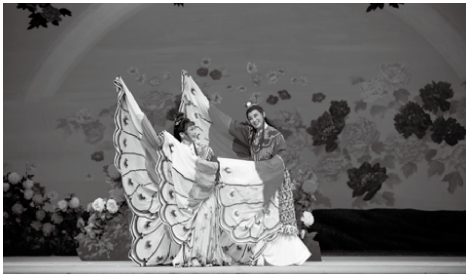
■ Stage photo of Yueju The Butterfly Lovers