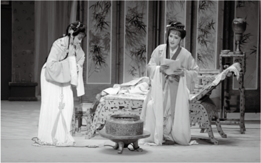
■ Stage photo of Yueju The Dream of Red Mansion

performing script follows the same plot as that in the book: Daiyu appears and meets with Jia's mother, and then Baoyu appears. Jia's mother introduces Baoyu to Daiyu, and Baoyu and Daiyu look each other up and down, and then began singing one after the other, which is different from the order in any previous manuscript. In the original script, Daiyu sang four verses first and then Baoyu sang six. Instead, it had been changed into the arrangement that Baoyu and Daiyu take turns to sing two verses each, forming a typical form of dialogue with two sentences vs. two sentences; the duet starts and ends with Baoyu. Looking at the relationship between these two protagonists, this order was obviously more in tune with their gender, identity and personality. As the starting point of the duet, "From Heaven Fell an Angle Sister Lin" brought this scene to a sudden peak which immediately captures the attention of the audience—and its ability to continue to do so explains why this scene has changed so little to this day.