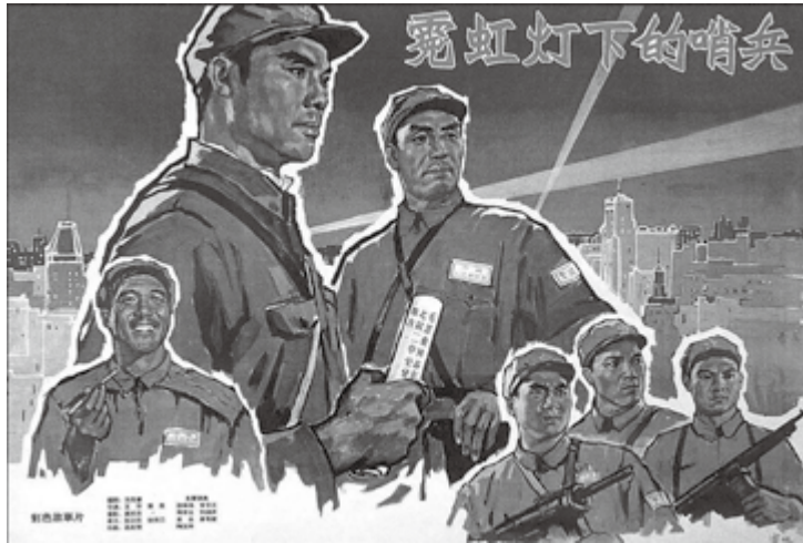
■ Poster of the film A Sentinel under the Neon Light

“The Eighth Unit on Nanjing Road”, as it’s colloquially known, is the 8 th unit of a battalion in the Shanghai Garrison of the Chinese People’s Liberation Army. After the liberation of the city of Shanghai on May 27, 1949, the 8 th unit played a central role in guarding, patrolling and keeping morale up on the busiest street in China at the time—Nanjing Road. In doing so, the company earned the praise of national leaders Mao Zedong, Zhou Enlai, and Deng Xiaoping, and soon after “The Eighth Unit on Nanjing Road” became a household name throughout China.