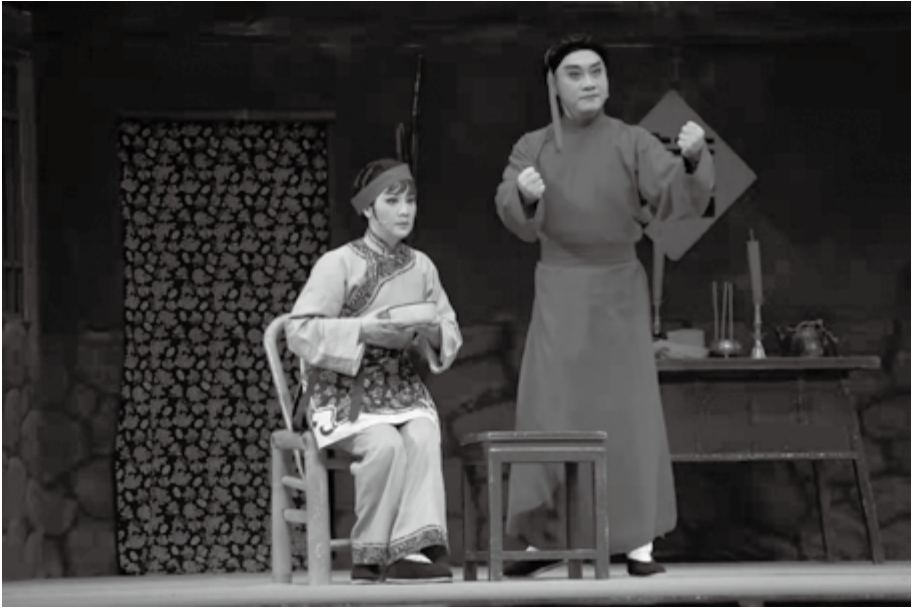
■ Stage photo of Yueju Xianglin Sao

Yueju. Accordingly, the makeup of Yueju is generally close to real life, different from the strong and exaggerated effect of Chinese traditional Xiqu makeup.