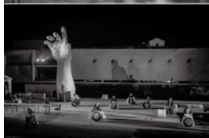
■ Poster and Stage photos of The Ballad of the Sad cafe