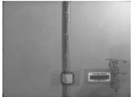
■ The cover of The Chinese Theater 3

The book was bound with yellow cloth. On the lower right corner of the cover, there was a portrait of female acrobatic fighting role of the Chinese Xiqu, drawn in red lines. The title of the book, the author's name and the publishing house were printed on the spine of the book. There was a color portrait of "an evil and stupid official with a beard" 1 on the title page, and a quote on the blank page saying, "To the memory of Lu Xun" on the blank page. It was a small book with a total of 63 pages and was divided into three chapters: the traditional Chinese Xiqu, Western-style Drama, and Yangko Drama. In order to help the English speaking readers better understand Chinese theater art, Mr. Chen introduced the three main forms and their development at that time. In the first part of the