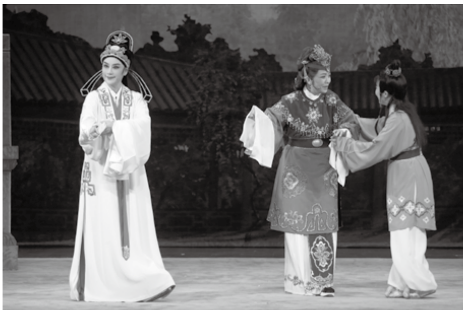
■ Stage photos of Yueju Romance of the West Chamber