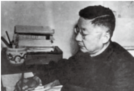
■ The photo of Lao She

The play Dragon Beard Ditch was adapted from the works of well-known Chinese novelist and playwright Lao She. It was first published in September 1950. Back in October 1949, Lao She returned to Beijing after furthering his writing career in America for three and a half years. After returning, Lao She was welcomed warmly by the government and