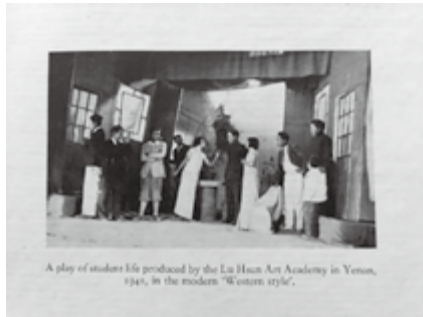
■ A play of student life produced by Lu Xun Art Academy in Yenan, 1941, in the modern “Western style” 3