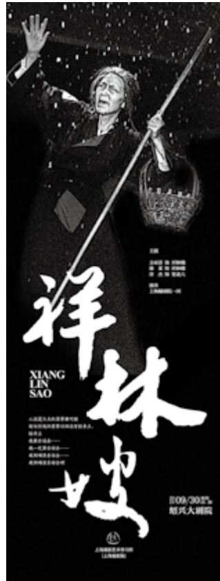
■ The poster of Xianglin Sao

Some researchers also believed that among Lu Xun's works that were written in the form of drama, Passers-by was the most typical, successful, and reflecting of the typical characteristics of drama style. The ideological nature of it and the sense of loneliness expressed in the drama, as well as the significance of literary history of it have not been paid enough attention. Passers-by has become an important motif in Chinese modern and contemporary literary creation, and even the prototype of Chinese modern culture. It is a typical situational tragedy without a trace of comedy.