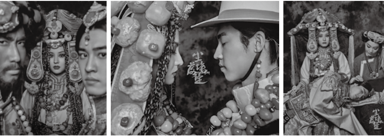
■ Poster of Red Poppies

premiered in Beijing Tianqiao Performing Arts Centre in March and has since been performed in six cities including Shanghai. Finally, it successfully ended its tour as the opening performance of the first Suzhou Bay Theatre Festival in May.