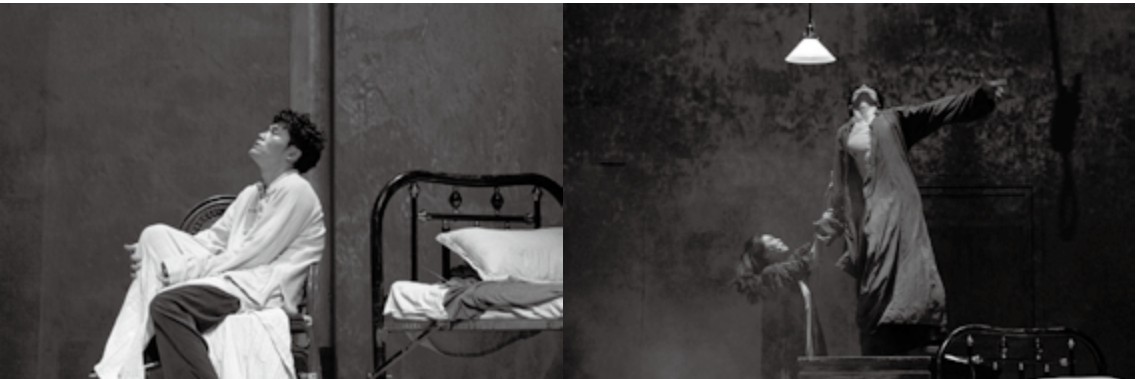
■ Stage Photo of Diary of a Madman

In the novel Diary of a Madman , Lu Xun put the evil side of human nature in an evil social environment. When Lupa was rehearsing the play in Beijing, he