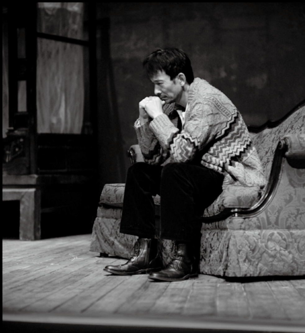
■ Stage photo of Diary of a Madman