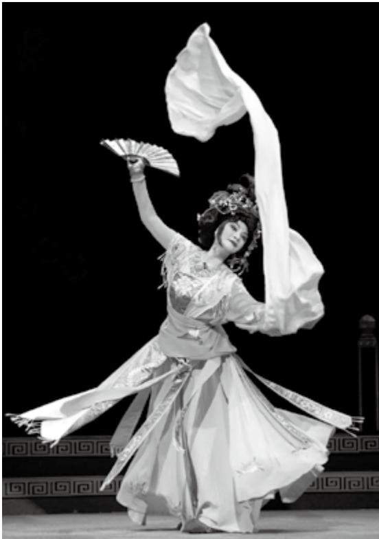
■ Stage photo of Wanwanqiang Yang Guifei · The Drunken Beauty