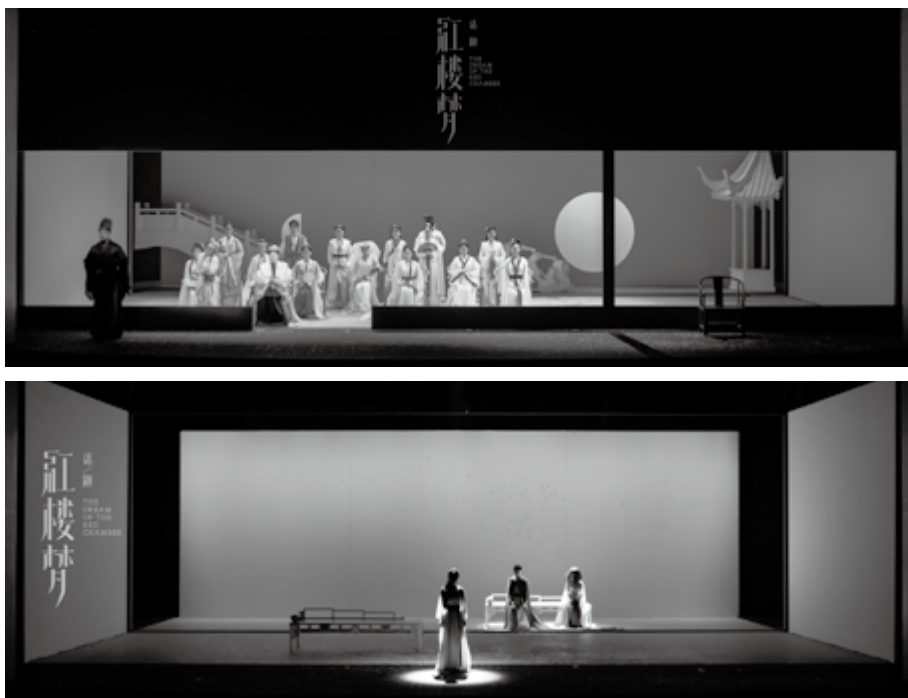
■ The Dream of the Red Chamber