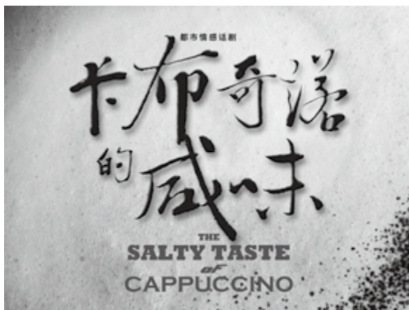
■ The poster of The Salty Taste of Cappuccino

The application of these symbols into the dram helped to form three different scenes. In the first scene, a woman's child died. Seeing this was like tasting a