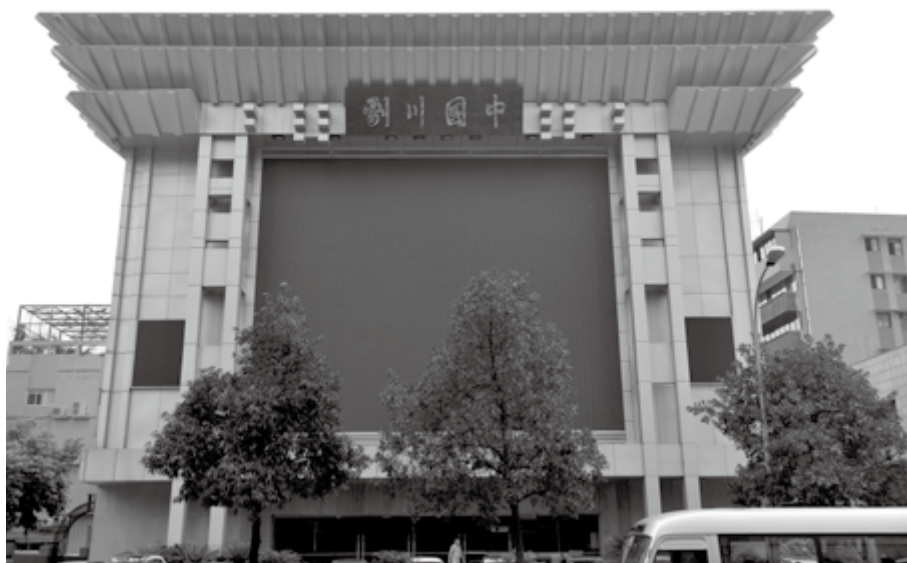
■ Chuanju Troupe of Sichuan Province (also known as Sichuan Opera Troupe)

The Theatre enjoys a good reputation in Southwest China and even the whole country for its artistic dedication to rigorous performances. Since its establishment more than 50 years ago, Chuanju Troupe of Sichuan Province