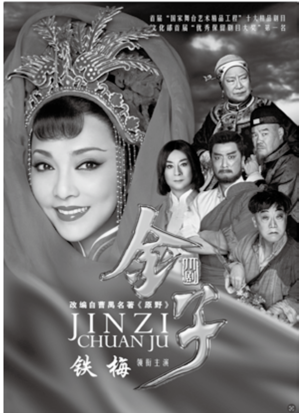
■ Chuanju Jin Zi performed by Chongqing Chuanju Theatre, starring Shen Tiemei.