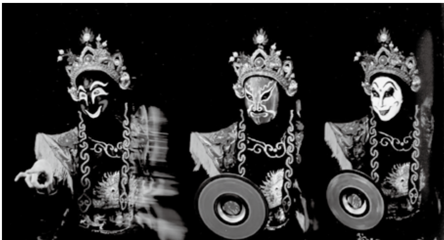
■ Face-changing in Chuanju The Legend of the White Snake

The most successful and influential combination of the face-changing skill and plot is the Chuanju The Legend of the White Snake . The story of the white snake is almost known to all people in China, and can be performed in almost every local theater genre. But the Chuanju version contains its own unique characteristics. For example, the Green Snake in Chuanju can change between