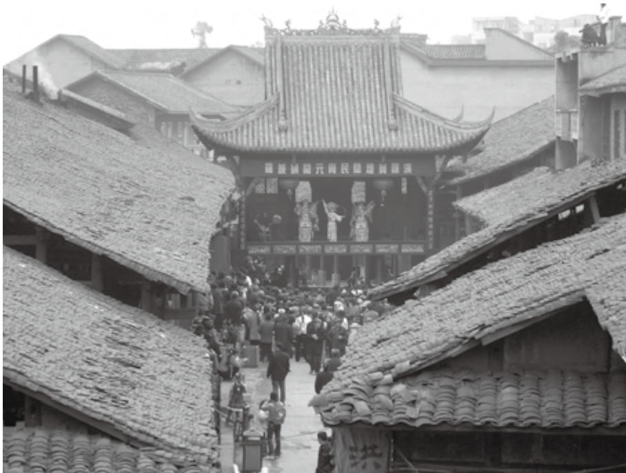
■ Ancient Xi Tai of Overpass Tower in Luocheng Town, Jianwei County, Sichuan.

Regarding the ancestral hall. Rural clan ancestral halls made-up a major feature of the ancient Sichuan countryside. After decades and hundreds of years of reproduction, the early immigrants from all over the country developed huge families. They established clan ancestral halls as important places for common worship of ancestors and discussion of family affairs. In the ancestral hall, there existed a Xi Lou, where the clan would raise money to hire a theatre troupe to perform at the clan gatherings and deliberations, annual festivals, birthday entertainment, weddings, and funerals.