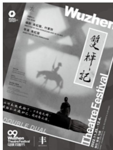
■ Double Dual , Wuzhen Theatre Festival poster