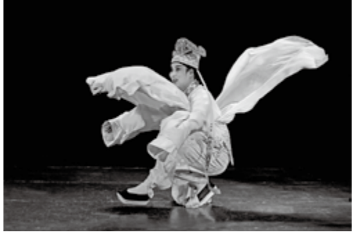
■ Zhezi Skills

style". The fabric used for Xiaosheng's pleats is generally crepe de Chine, which is light and elegant, with high slits for easy performance. Their water sleeves are not the extension of the sleeve of the pleat, but the long sleeves of the "fragrant sweatshirt" worn inside the pleat, which is inspired by the clothing characteristics of Sichuan Paoge Association.