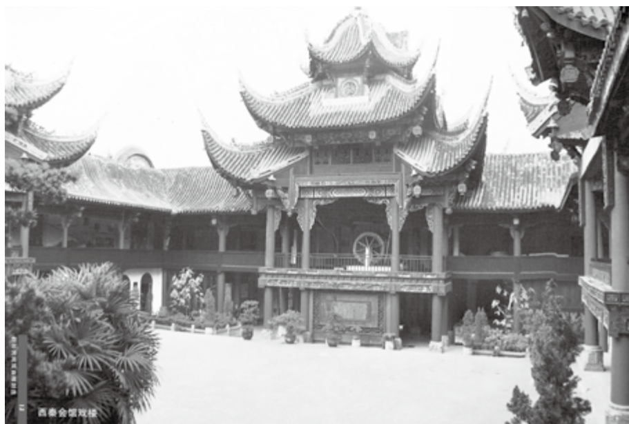
■ Xi Lou at Zigong Shannxi Merchant Guild Hall