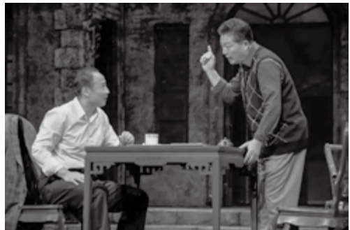
■ House Guest