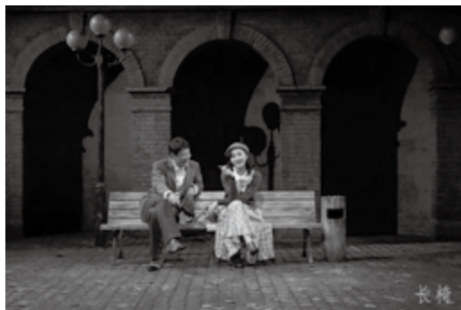
■ The Bench

From September 30th to October 17th, the small theater play The Eternal Flame of Van Gogh , produced by the Beijing People's Art Theatre, returned to the stage of the People's Art Experimental Theatre. This production focuses on several key moments in Van Gogh's life and presents his simple