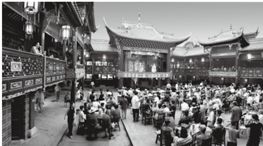
■ Xi Lou at Yunnan Guild Hall in Yibin City, Sichuan