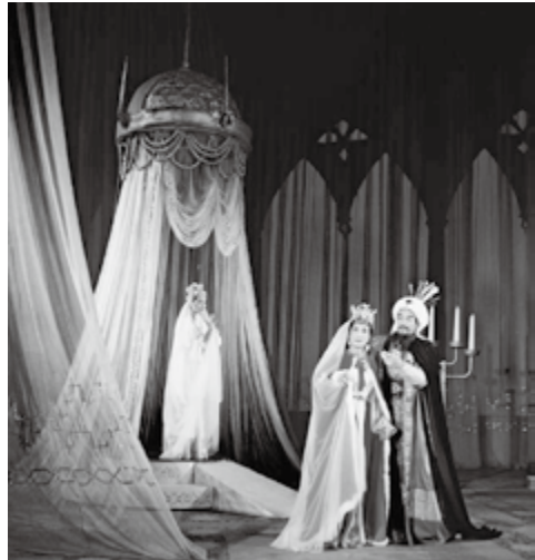
Consort of Peace, 1979