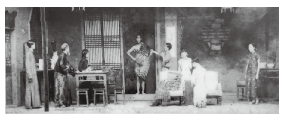
■ Peking Man, 1942

theatre with his stepmother in childhood, and Tianjin Nankai High School, where he studied, was the cradle of modern Chinese theatre movements. The school had excellent artistic atmosphere, experienced instructors, a formal theatre association and abundant performing practices.