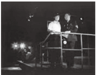
Absolute Signal, 1982

and cultural atmosphere in the 1980s influenced the ecology of drama and challenged the perspective of dramatists. Finally, Absolute Signal (edited by Gao Xingjian and directed by Lin Zhaohua), which was performed in Beijing in 1982, was regarded as the manifesto of Chinese experimental theatre movements. After that, drama theorists initiated a theoretical discussion on "what is experimental theatre", and made a summary of the drama of Chinese experimental theatre in the 1980s.