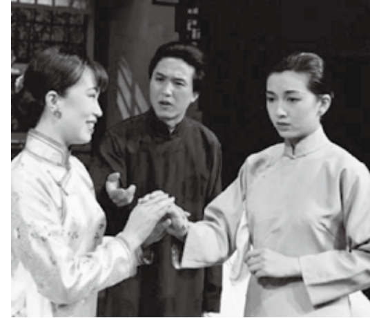
■ Peking Man , 1957