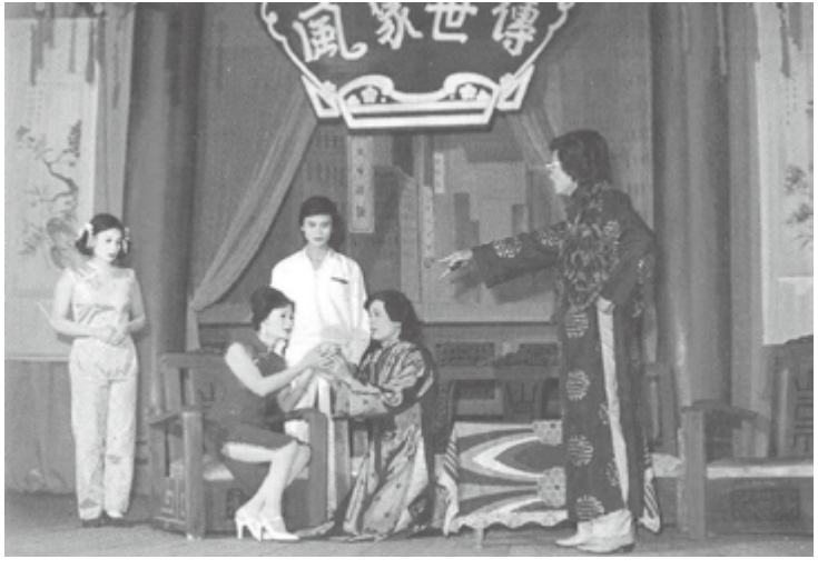
■ Thunderstorm, 1989

A mid-length Pingtan lasts two hours. It is impossible to copy a four-hour classical