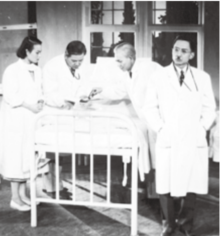
Bright Skies, 1954