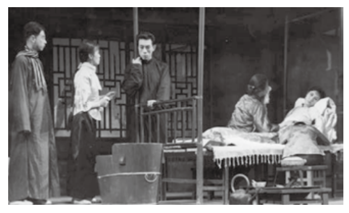
The Family, 1954

I remember it was in 1942 during the steaming hot days in Chongging. I wrote The Family on a boat anchored in the Yangzi River...The crew