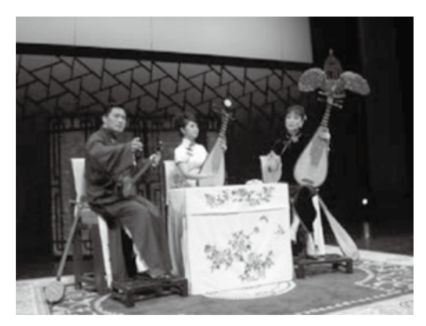
■ Thunderstorm, 2010

But she never got Zhou's love. The marriage was also not consummated. In despair and thirst of love and sex, she fell in love with young Zhou Ping. This thirst, capture and struggle for love and sex pushes forward the metamorphosis of the character relationship and the tragedy. Finally, the "cruelty and coldness of the struggle in the universe", borne in Cao Yu's mind constantly, burst out. <sup>1</sup>