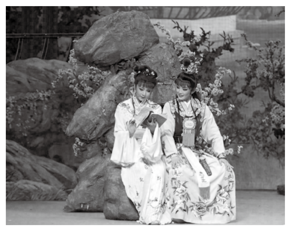
■ Dream of the Red Chamber

The playwright Xu Jin extracted a clear clue from the novel: the love story of Jia Baoyu and Lin Daiyu, and naturally including Jia Baoyu's mischievous behaviour. The Yueju version longed for free love. Jia Baoyu and Lin Daiyu were rebels of the old days and were incompatible with the surroundings. With the development of the plot, it imputed the tragedy in the class oppression nature of ritual law. Besides the theme of resisting the old social system, and thus the Yueju Dream of the Red Chamber , also acquired its political legitimacy.