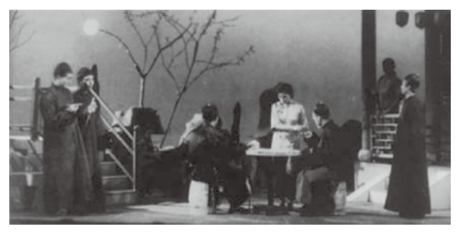
■ The Family, 1948

to test them. He not only stripped away the purity on the surface and interrogated the evil hidden underneath, but also tortured the purity hidden under the sin. He also refused to let them die easily and tried to keep them alive for a long time. Dostoevsky seemed to be distressed together with him, and happy with the interrogator. This is by no means something that ordinary people can achieve. In short, it is because of greatness." <sup>1</sup> Lu Xun's description of the aesthetic features of Dostoevsky's novels also in a sense, reflected the tendencies of his own creative psychology. Cao Yu, like Lu Xun, was also a great writer with a deep sense of self-directed cruelty.