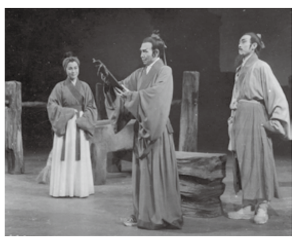
Courage and the Sword, 1961

By the late 1950s and early 1960s China was a nation of young people, detached from the past and ready to compete with the outside world. At the same time, the country had experienced the greatest difficulties with its economy and international relations. Following the disastrous Great Leap Forward campaign, China suffered unprecedented famine, and the Sino-Soviet split exacerbated China's economic situation. "Self reliance and arduous struggle" was now the motto for the nation to follow; professionals in literature and arts were encouraged to produce works supporting the Party's