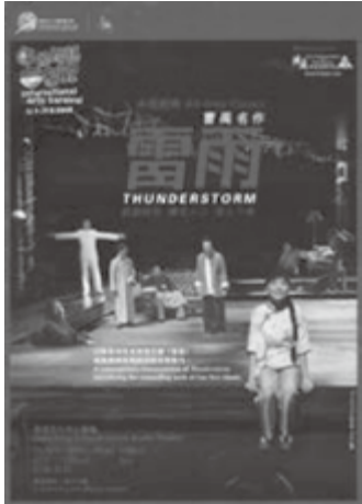
■ Thunderstorm, 1935