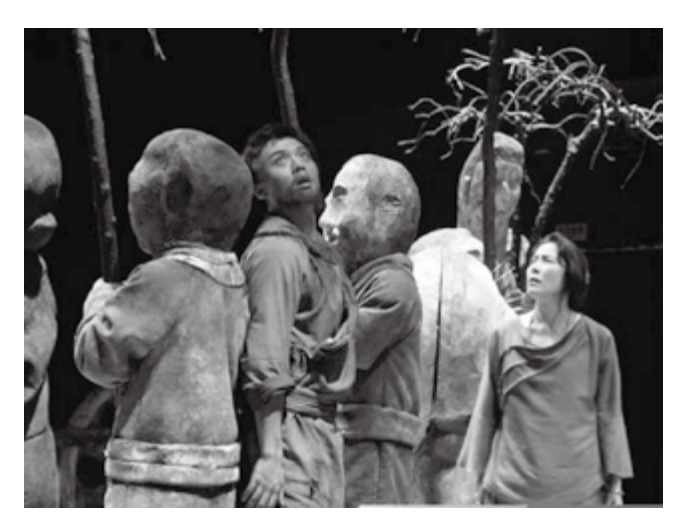
The Wilderness, 2005

the playwriter switched the protagonist from Qiuhu to Jinzi, enriching its social content and reflecting by a condensed revealing of Jinzi's fate. The storylines of Jinzi and Qiu Hu intertwined and echoed with each other, making Qiu's revenge more exciting and attractive.