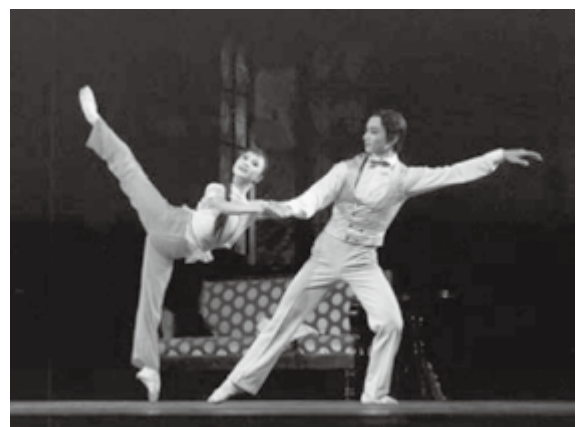
■ Thunderstorm, 1981