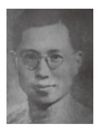
Cao Yu in 1940

The word "anxiety" originates from the Hindi word "angh", which is related to "narrowness" and "restraint". It is a typical psychological phenomenon, reflected in almost everybody but to different degrees. According to Verena Custer, "when we feel an accumulation of unpleasant excitement, we call it anxiety. Anxiety is a form of excitement that is unpleasant". While modern anxiety in artistic thinking is also expressed to some extent in the